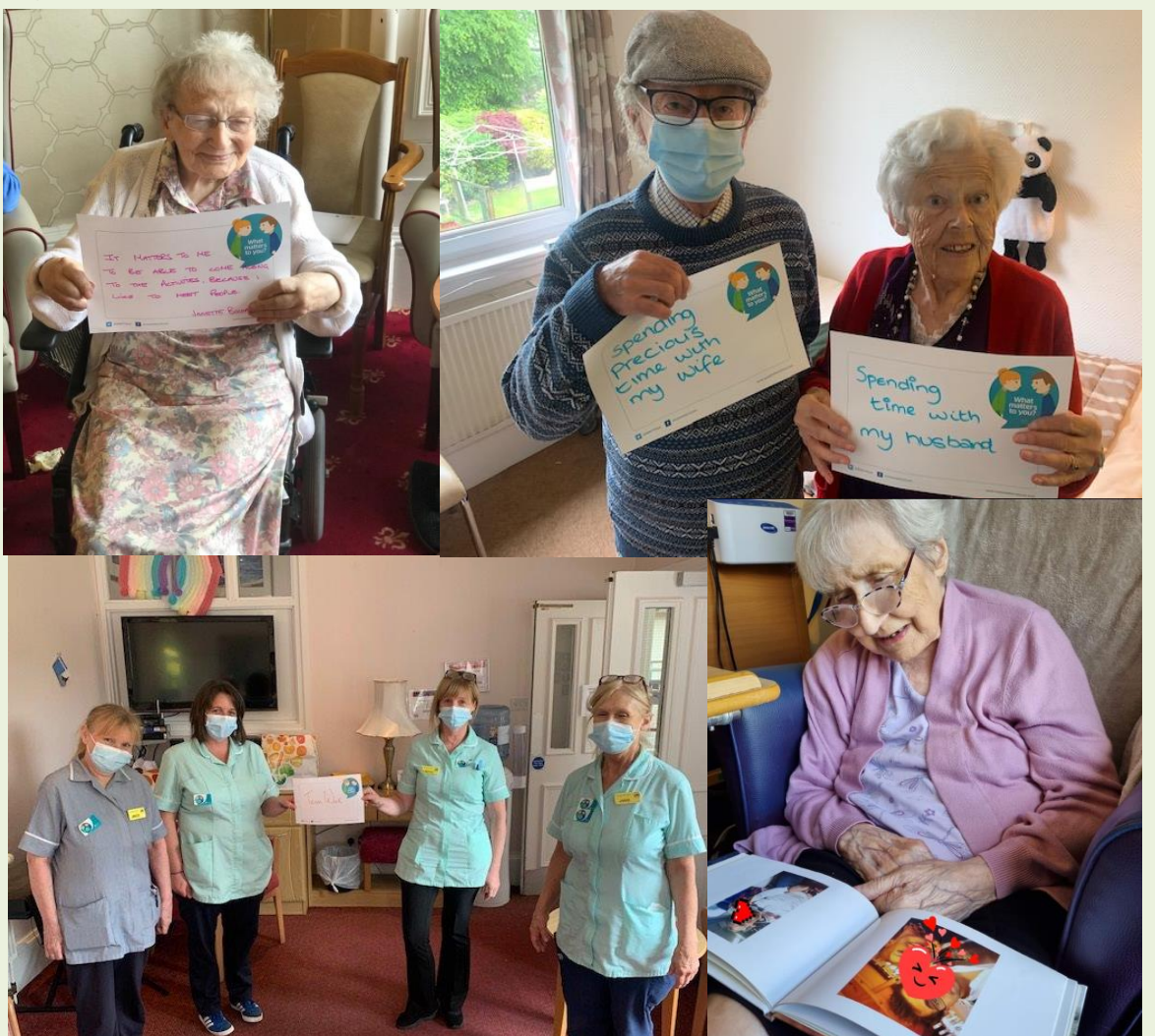
Figure 2.3: What matters to residents, their families and staff in Alt Na Craig, Merino Court and Glenfield Care Homes