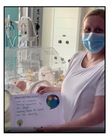
Figure 3.2: What matters to a mum in neonates, RHC

Others wanted to be discharged; and some prioritised symptom control and comfort.