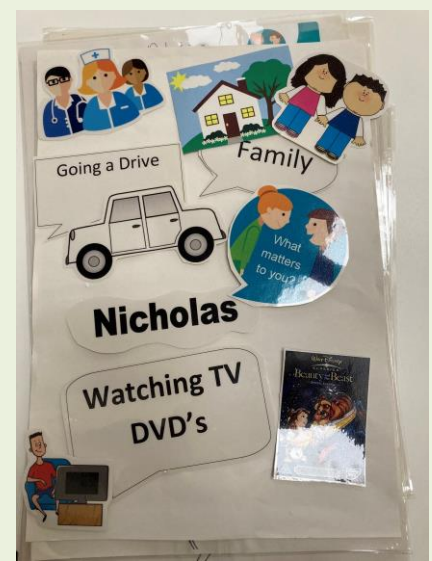
Figure 5.1: What matters to a patient in Claythorn House

The care plans here help to inform other staff about that person – their medications, their history (for example, if their parents are deceased). Students here say it helps them get to know the person before they talk to them.