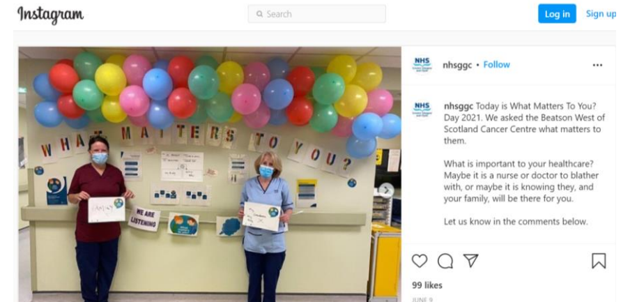
Figure 2.1 Staff at the Beatson share what matters to them

Engagement directorate shared 35 posts on Facebook, Instagram and Twitter between Thursday 3 June and Friday 11 June in celebration of WMTY, including excerpts from patient feedback on Care Opinion, staff celebrating WMTY (see example in Figure 2.1) and Board Members sharing what mattered to them.