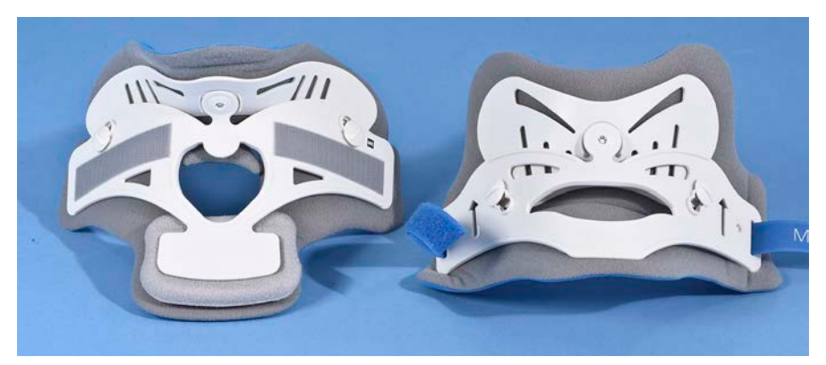
Front of Collar