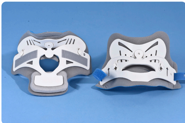
Front of Collar