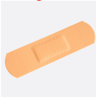
Cover it - with a waterproof dressing