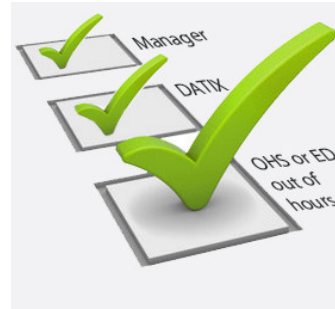
You need to report it

There is a potential risk of transmission of a Blood Borne Virus (BBV) from a significant occupational exposure and staff must understand the actions they should take when a significant occupational exposure incident takes place.