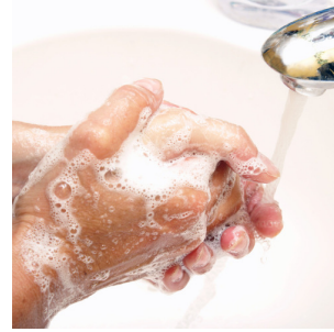
Wash it - with soap, under running water