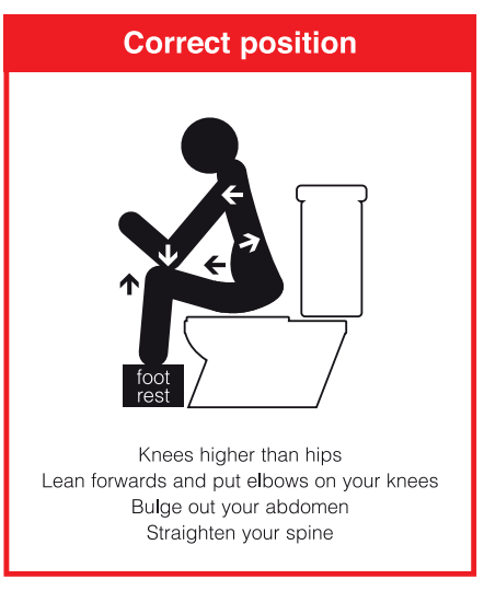
Figure 3: Correct position for opening your bowels