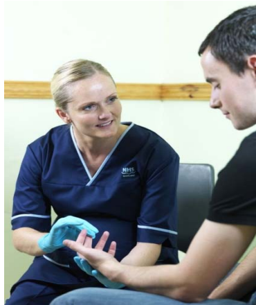
Delivering better health