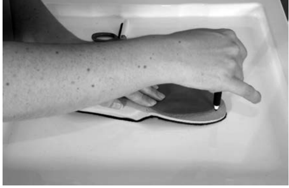
Draw around the inlay at the toe end section.

Set the inlay onto the back of your insole which needs trimmed. Line up at the heel.