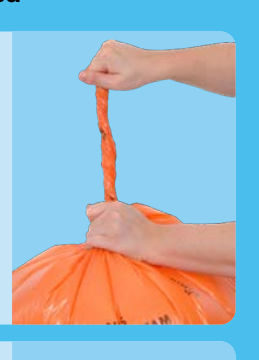
Fold over the neck of the bag to make a "swan neck"

Hold the bag by the neck and twist until tight