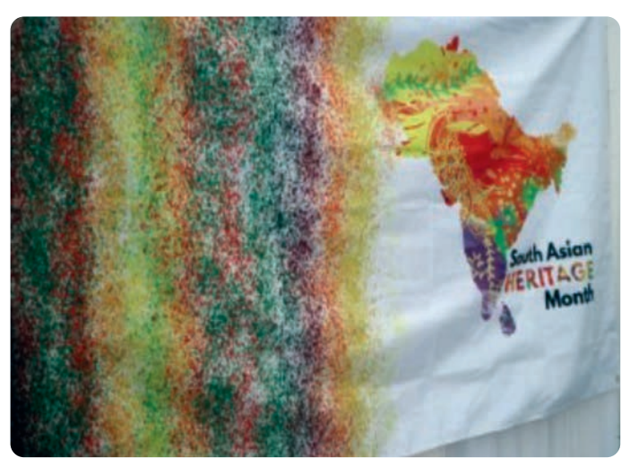
NHSGGC's BME Network celebrated South Asian Heritage Month on 17 August 2023 with this flagan evening of South Asian food, music and stories from colleagues with South Asian Heritage about their experience of living and working in Glasgow and the Health Service