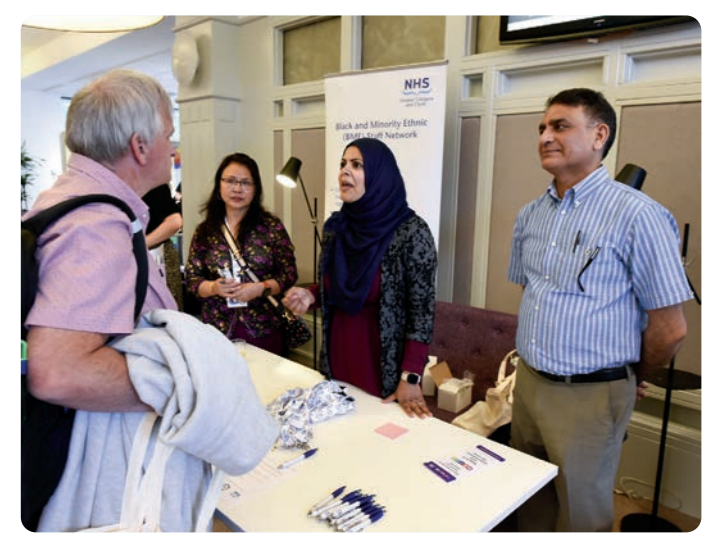
NHSGGC's BME Staff Network stand at our first Equality, Diversion and Inclusion Conference – June 2023

October is Black History Month • Down Syndrome Awareness Month • Lupus Awareness Month • Breast Cancer Awareness Month • Global Diversity Awareness • Menopause Awareness Month