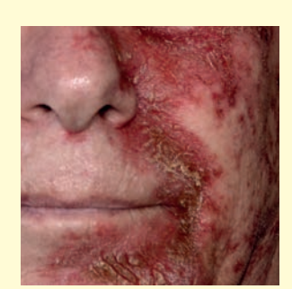
Treatment day 21