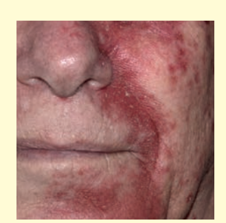
Treatment day 14