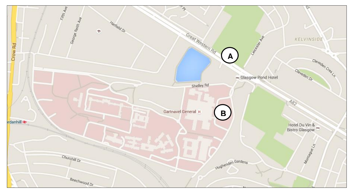
Figure 2: Gartnavel Hospital Bus Stops

These are the stops closest to the hospital served by the different routes. More information about the bus service, routes, frequency and catchment areas served can be found in table 5. The information was generated using Traveline Scotland with the final destination chosen as Gartnavel Hospital Main Entrance on Gartnavel Hospital.