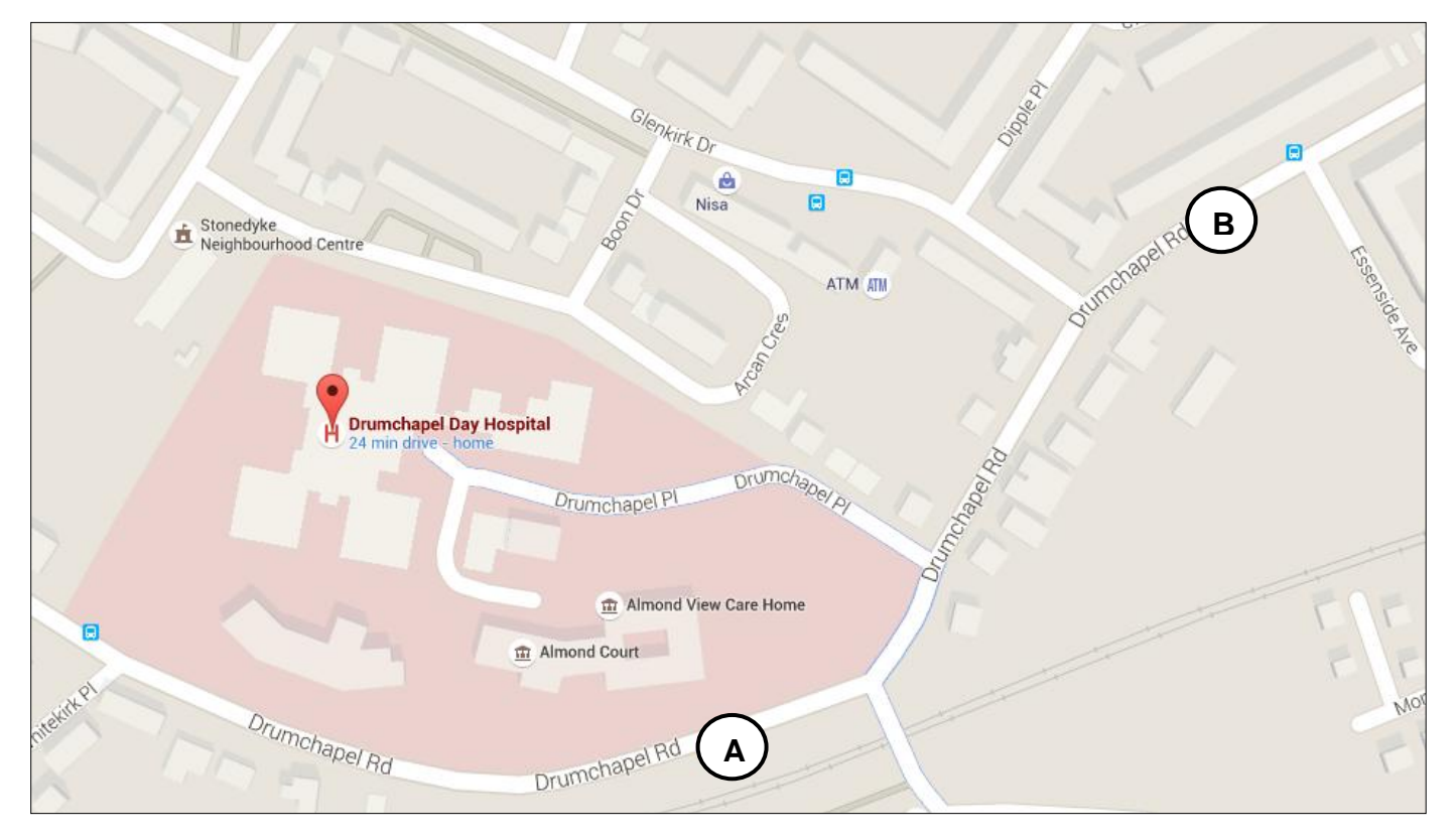
Figure 1: Drumchapel Hospital Bus Stops

These are the stops closest to the hospital served by the different routes. More information about the bus service, routes, frequency and catchment areas served can be found in table 5. The information was generated using Traveline Scotland with the destination chosen as Drumchapel Place due to Drumchapel Hospital not being a selectable option.