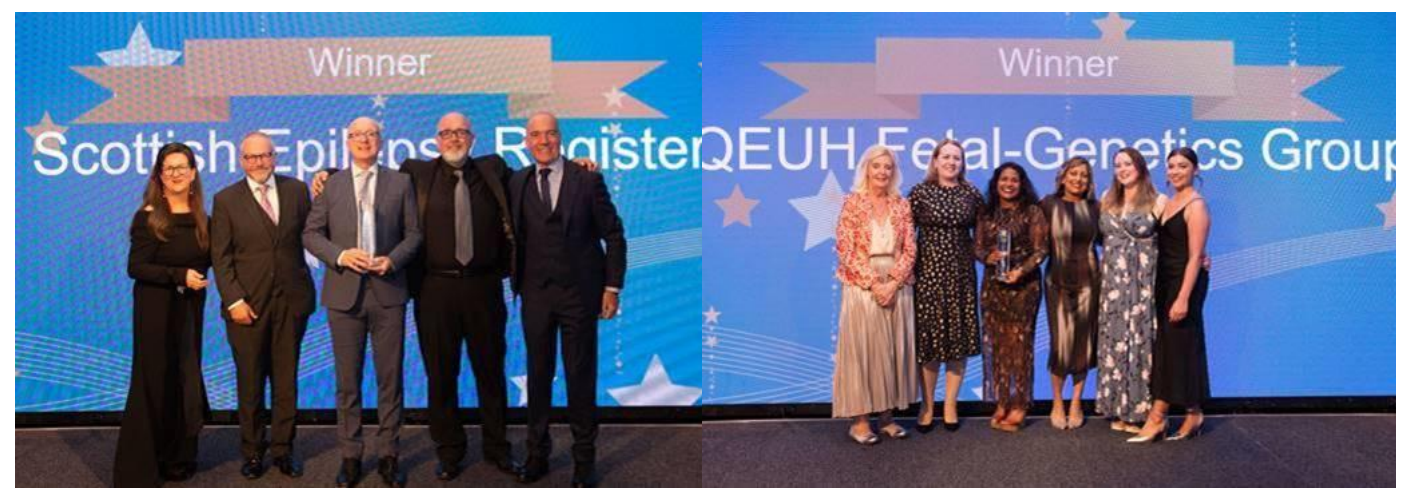
Scottish Epilepsy Register Team

undergoing a pregnancy where there is a known family history of a genetic condition and/or pregnancy loss.