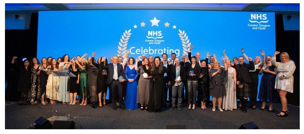
Local Award winners

Click here for more information on each of the winners.