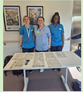
Victoria Gardens global tea party and the West Quadrant Community Dietetics team

On 'Thirsty Thursday' we gave a special thank you to both chefs who supported the development and testing of project milkshake.