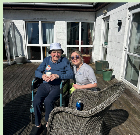
Enjoying a caffeine free drink in the sunshine