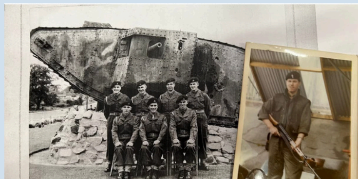
Then and now ❤️

Buchanan House also shared with us some great pictures of some of their residents from the war and them today.