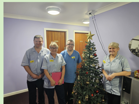
The Newark Care Home Mealtime Champions

We first met with the champions back in June 2023. After attending training, they observed the mealtime experience and noted what was working well and what could be improved. They also asked residents for feedback on their food and drink, and discussed what they had found with the Food, Fluid and Nutrition (FFN) team over the last 6 months.