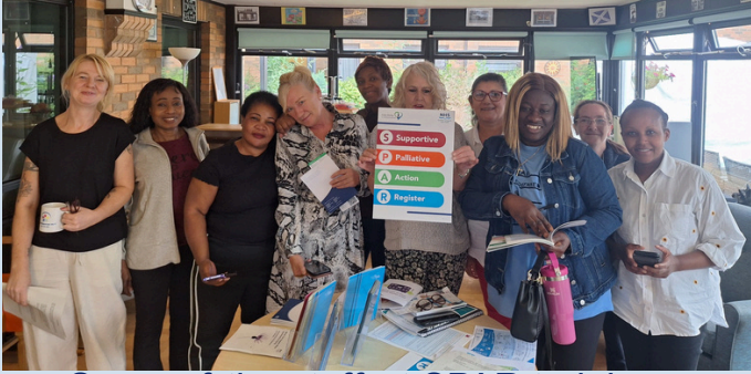
Some of the staff at SPAR training

The staff at Eastwood Court were delighted to celebrate the launch of SPAR, the palliative indicator tool last month. Residents enjoyed a SPAR inspired cake for afternoon tea.