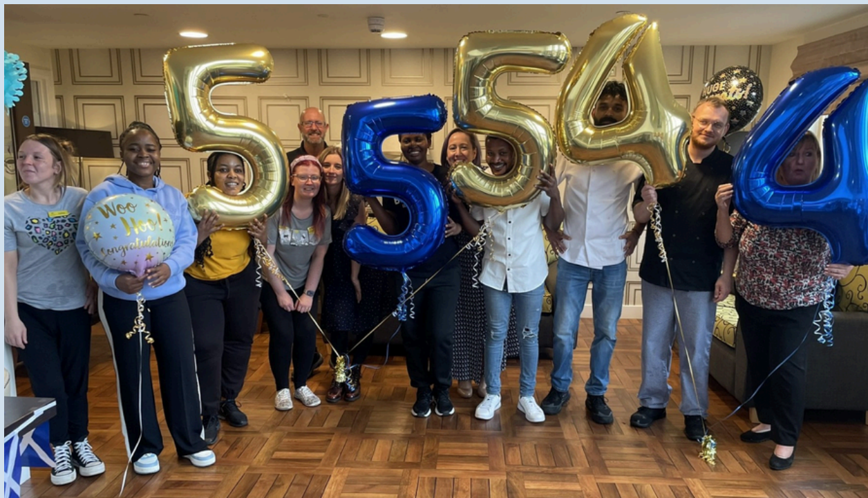
Staff celebrating their new grades