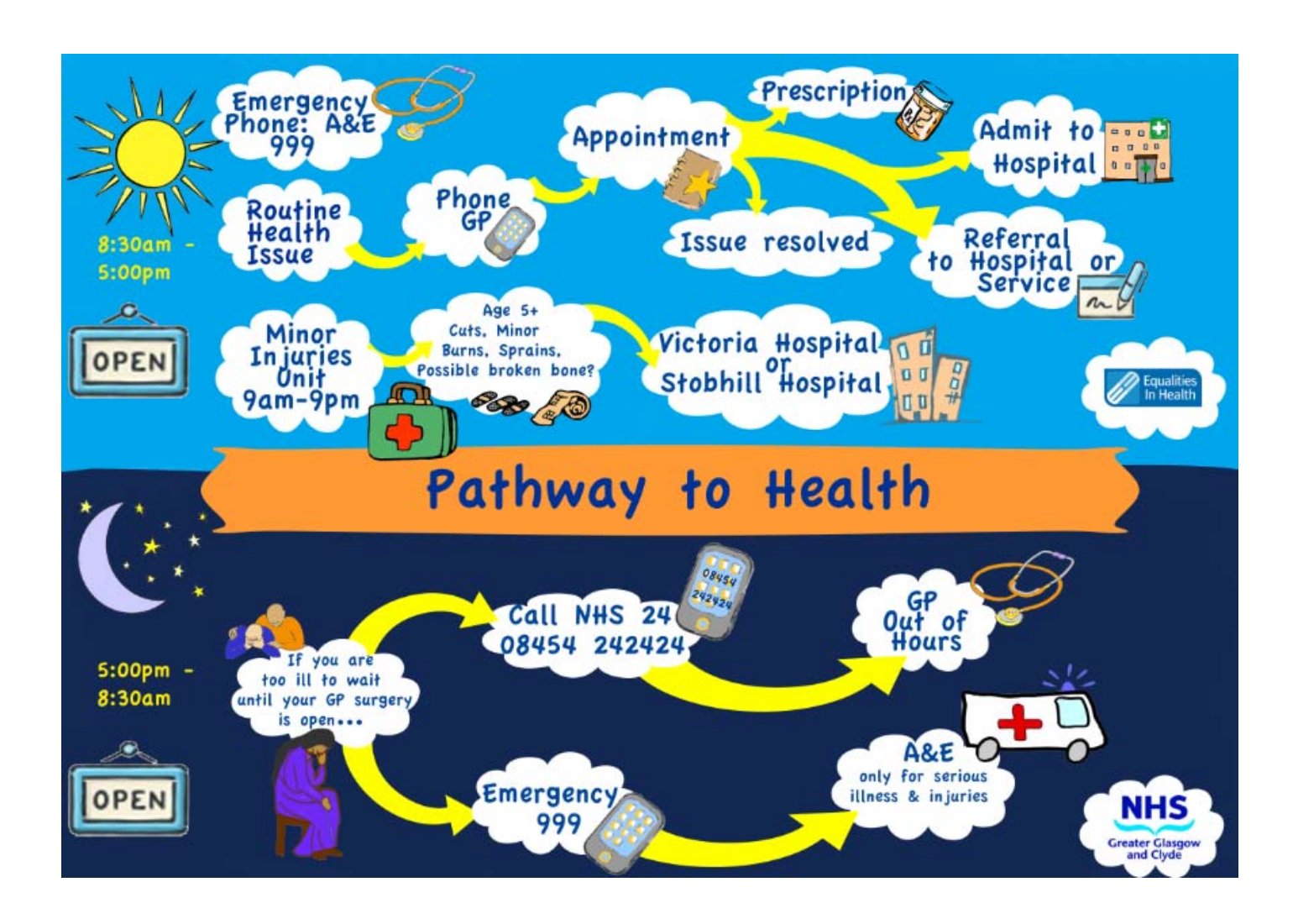
Appendix III Pathways to health leaflet translated into 21 languages